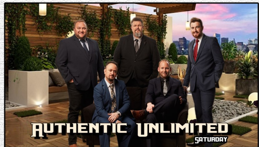
AUTHENTIC UNLIMITED SATURDAY