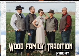
WOOD FAMILY TRADITION FRIDAY