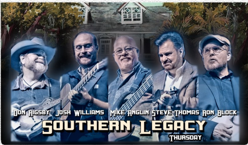
SOUTHERN LEGACY THURSDAY