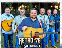
RETRO 78 SATURDAY