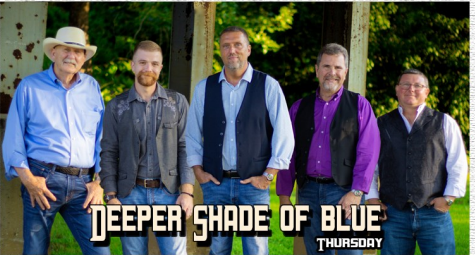
DEEPER SHADE OF BLUE THURSDAY