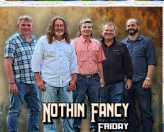
NOTHIN FANCY FRIDAY