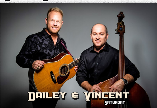
DAILEY & VINCENT SATURDAY